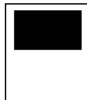
HALF PAGE 4 3/4" WIDE BY 3 7/8" HIGH $250